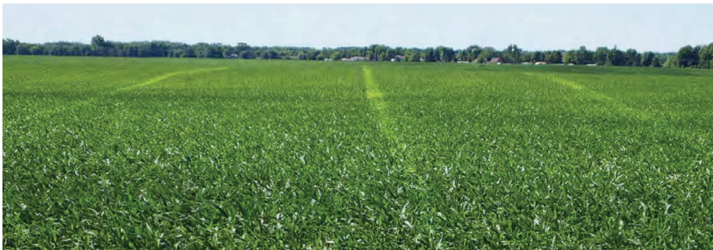
With a Hiniker Nitro-Lert System, plugged or partially blocked knife outlets can be easily detected before it's too late as shown in photo.

With a Nitro-Lert system you'll detect problems as they occur, while they can be corrected!